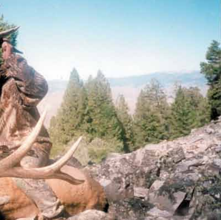
Future Rawhide Outfitter Guides Sage & Jared Cranney